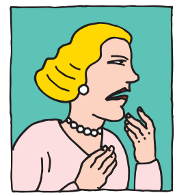
Upset or nervous