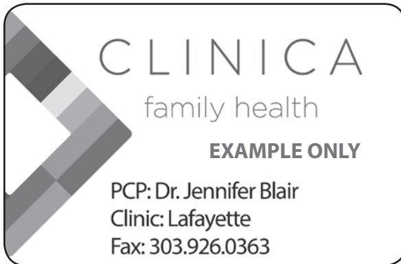
Front of Card